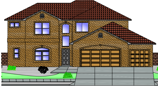
Spanish Mission (A)